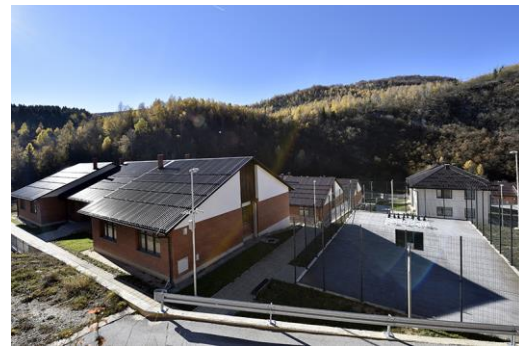
Asylum Center in Trnovo